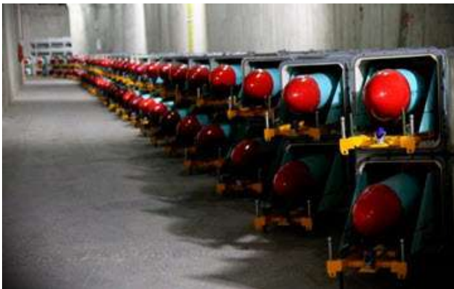
Pictured above: Iranian missiles stored in an undisclosed location

Of course, we know that Haman's diabolical plans were thwarted. By God's grace, the terrible edict was rescinded. The Jews then turned the tables on their enemies. This culminated in the hanging of Haman on his own gallows, and also included the hanging of his ten sons.