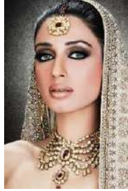
Queen Vashti e.g. The Adulterous House of Israel

When we receive the 'TREE OF LIFE' and care for it, we eat its fruit (seed) and it grows within us, as a baby grows inside its mother. If the mother will not receive the seed of her husband, she cannot reproduce. If she receives seed from someone other than her husband, she produces a bastard child who is cursed by his father. It is called adultery!